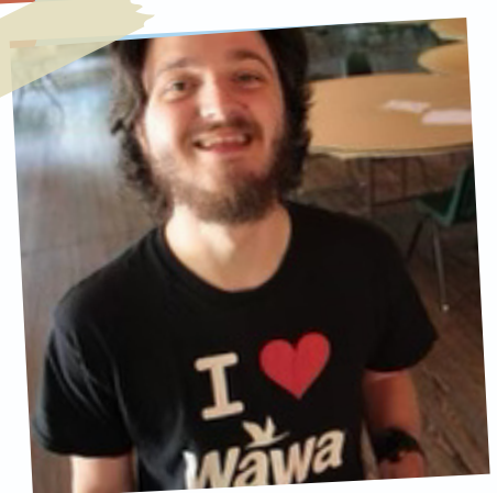
Staff Summers 2021 --

This year I've been doing a lot of music related events. I've performed in the pit of an off-broadway musical, traveled the country to compete in band festivals, and my favorite part, teach! Although it's not camp, I try to bring the fun and positive energy as if it were! Can't wait to see you all soon.